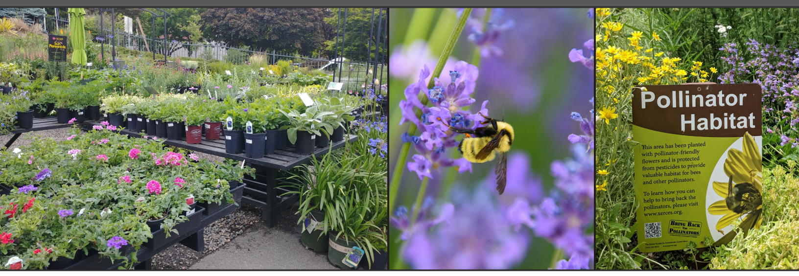
Plants grown for sale in retail nurseries, even those marketed as "pollinator-friendly," are commonly treated with pesticides. Learning more about your local nursery's pest management practices and ensuring the flowering plants you purchase are free from harmful pesticides are important steps in protecting pollinators.

Pollinator gardening has skyrocketed in popularity. Increasingly, garden centers and nurseries are labeling plants as "pollinator-friendly," or adding bee or butterfly images to plant tags to denote their ability to attract these wonderful insects to the landscape.